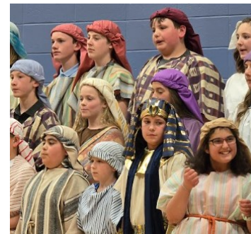
A couple photos from our Spring Concert