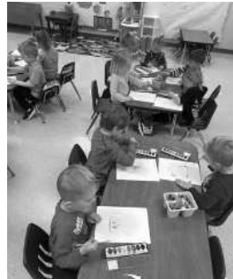
3K students enjoying watercolor painting.