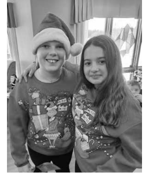
Fourth and fifth grade students went Christmas caroling at Country Gardens and the Nursing Home. There were a lot of happy residents!