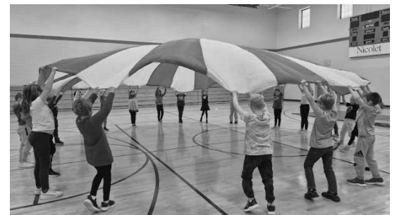
Students have been enjoying gymnastics/tumbling and parachute activities in gym classes.