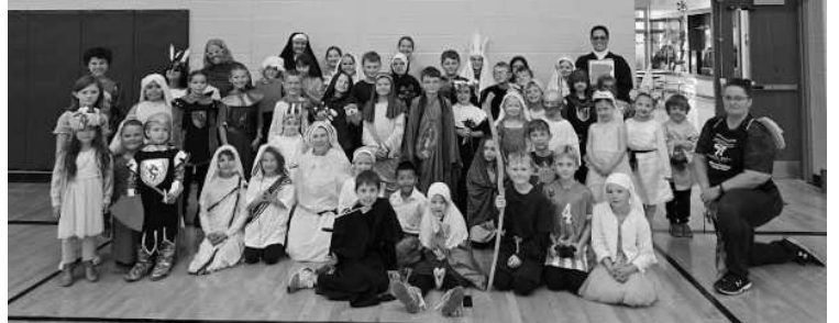
Staff and students enjoyed dressing up as saints.

Each Student Matters, Every Moment Counts, Christ in the Center