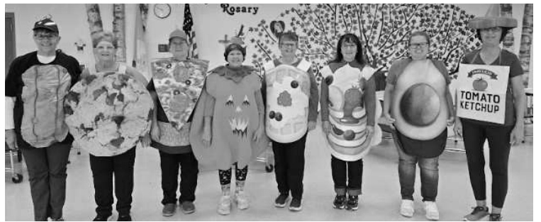
Our AMAZING kitchen staff and some of our volunteers. Thank them for all they do!