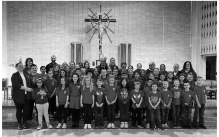
Students in grades 2-6 travelled to Tomahawk last week to attend Mass with the Bishop for Catholic Schools Week.