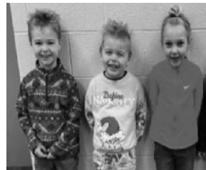
Catholic School's Week Crazy Hair Day!

Each Student Matters, Every Moment Counts, Christ in the Center